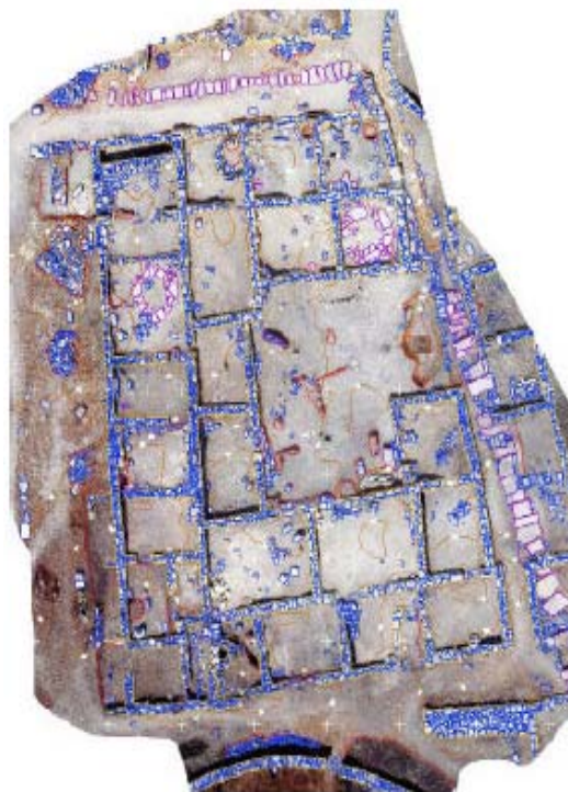
Figure 3. Dilos final mosaic with the vector overlaid

difference of 13.5. In particular, within the scene there were height differences of 2.5 meters in the walls, which from 22.5 m which was the selected flying height, develop a 1:9 ratio of object depth: camera-object distance.