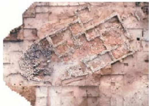
Figure 2. Final orthophoto on Asprovalta (original 1:100)

This was the first commercial project with the radio-controlled helicopter and therefore a number of unexpected problems were confronted. Statistics of this project appear in table 1. The scale of the photography relatively to the final orthophotomaps scale was not very well calculated, although it has been proved afterwards that the achieved quality on the final printout was very good and there were no complaints reported by the end users. Although this project has been planned for 1:100 scale final orthophotograph, it was also printed in 1:50 and it was reported as most satisfying.