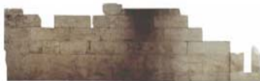
Figure 5. Three meters high corridor. The dark part was under shadow and processed with wallis filtering, prior to mosaiking

and used to calculate the best fit (using least squares) vertical plane passing through the control points of each section or facade. The new coordinates were calculated, with the Z being the distance from the best-fit surface.